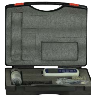
FG-7000T with Included Accessories and Carry Case