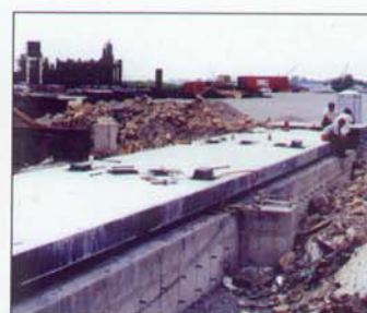
The load cells are installed, and the deck is raised 6 inches.