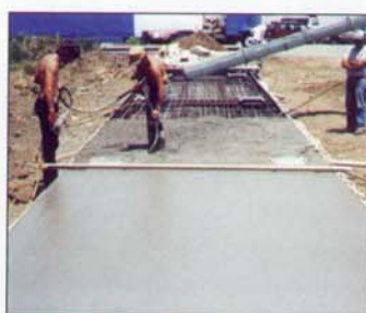
The deck concrete is poured, vibrated, and screeded.