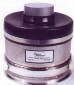
High-performance Model 136 Load Cell, with a capacity of 75,000 lbs. Grade 304 stainless steel construction.