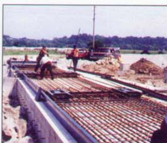
A double layer of rebar is completed.