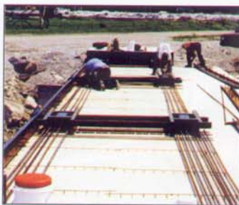
Deck assembly begins with side channels, steel nests and rebar.

The deck has a free-floating (360°) bridge design, for high accuracy and has a low 16-inch profile with a full six-inches of clearance under the deck for easy clean-out. Higher clearances are available. The load cells are accessed from the top, and the platform is totally safe for explosive areas. Standard decks are 10 feet and 11 feet wide, and up to 180 feet or more in total length. (Multiple platforms may be needed for scales over certain lengths.)