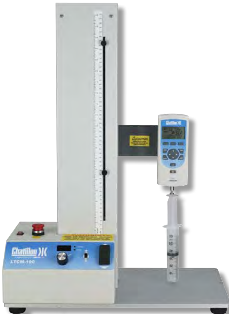
Shown: LTCM100 Series with optional DFS Series force gauge.