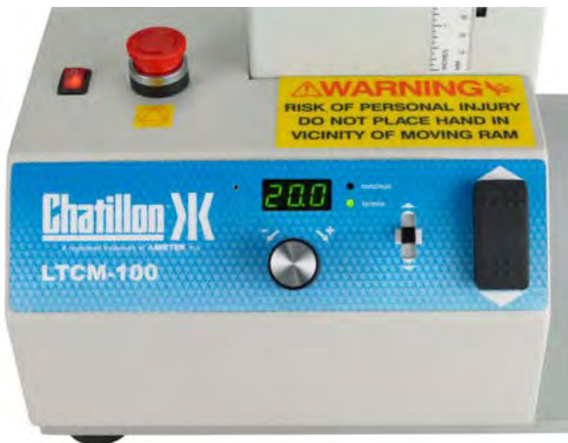
Shown: Control panel is designed to promote ease-of-use. All controls are located on the control panel and away from the work area, making the LTCM100 Series ideal for busy production environments.

The optional crosshead travel extension arm can be used when testing very elastic samples. This accessory adds an additional 15-inches (380mm) of travel for your sample.