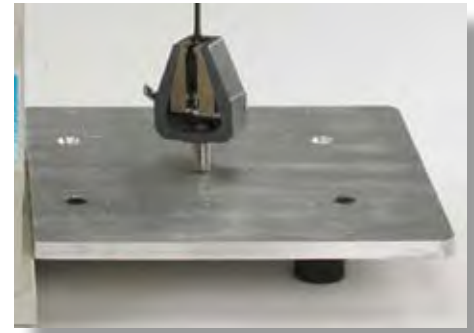
Shown: A large work area simplifies testing setups especially for large samples. Pre-drilled holes make fitting fixtures and specialized testing jigs easy.

The crosshead has been optimized for use with Chatillon DF Series digital force gauges. The DF Series mount directly to the crosshead without special adapters. The work surface features 13 individual mounting holes (#10-32) for installing grips or special fixtures.