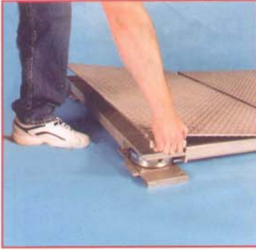
Deck is raised and lowered by hand, like the hood of a car.