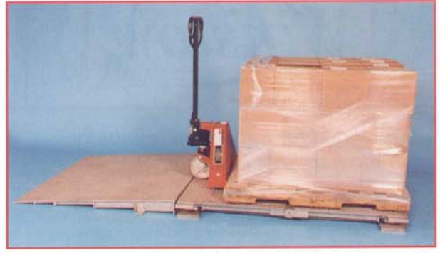
Optional access ramps and tread-plate deck. Low-profile scale just 3.75 inches high.